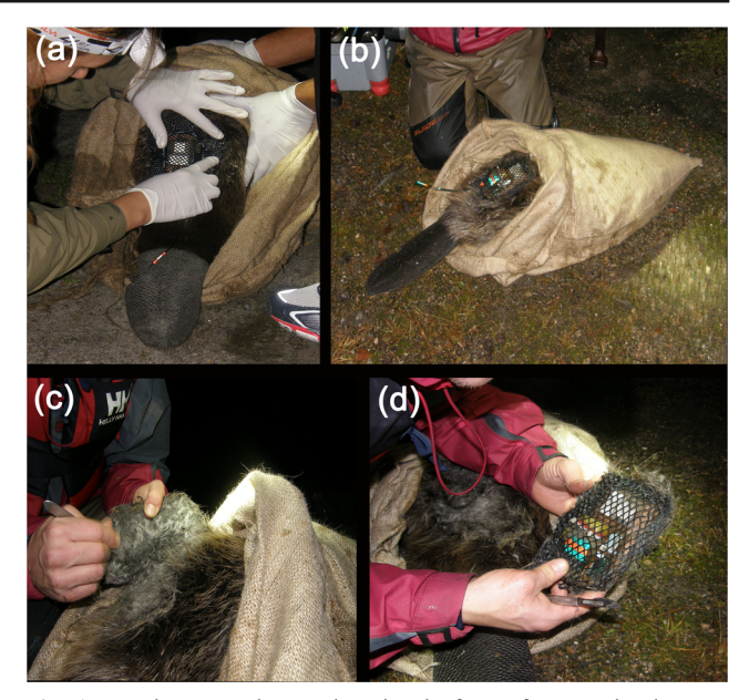
Fig. 1 Tagging procedure and retrieval of tags for Eurasian beavers ( C. fiber ) in southeastern Norway (2009–2014). Beavers were handled and tagged in cloth bags without the use of anaesthesia. a A GPS unit is glued onto the fur of the lower back (15 cm on top of the scaly tail) using two-component epoxy resin. b By using VHF-telemetry, a beaver tagged both with an accelerometer and a GPS unit has been recaptured. c The tag is cut out of the guard hair with a scalpel, leaving the under-fur intact. d The tag is retrieved

affected the guard hairs, with the under-fur remaining unaffected (Graf et al. 2015).