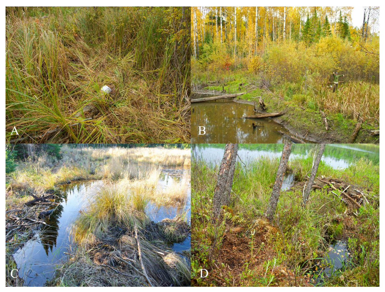
Fig 2. Examples of evidence found at beaver kill sites (A,B,C), and of wolf behavior when in active beaver habitats (D) in Voyageurs National Park 2015. A) Matted vegetation at kill sites provided important information about how wolves killed beavers. B) Co-author Homkes stands at Beaver Kill Site 13 <10 m below an active beaver dam. C) Beaver Kill Site 18 on a small point <5 m from the active dam where a wolf, based on the trampled vegetation, presumably pulled a kit beaver out of the water and consumed it. D) A wolf bed (lower left corner) found when examining clusters of GPS-locations in the spring. The wolf bedded for \geq 4 hr next to this active beaver lodge without making a kill.